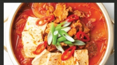
S14 Kimchi Jjigae