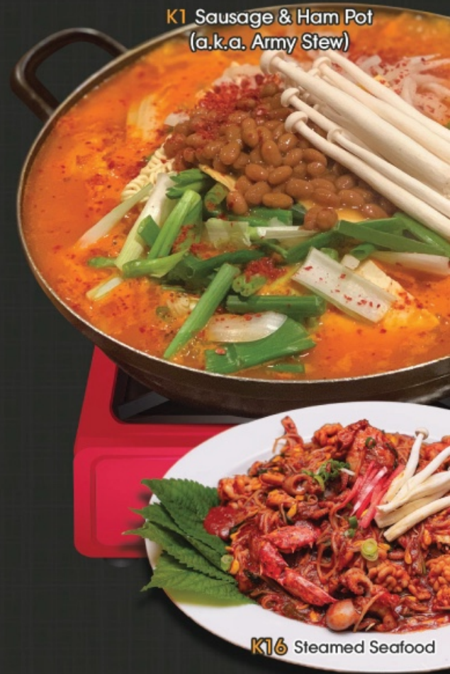
K1 Sausage & Ham Pot (a.k.a. Army Stew)