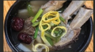
S2 Wang Galbitang