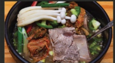
S3 Ugeoji Galbi tang