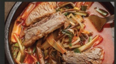
S8 Yuk gae jang