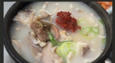
S5 Dwaeji Gukbap