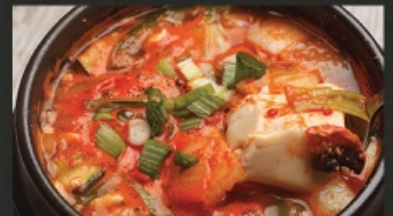
S12 Sundubu Jjigae