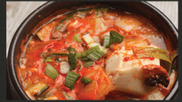
S2 Sundubu Jjigae

Soybean paste stew boiled with tofu and assorted vegetables