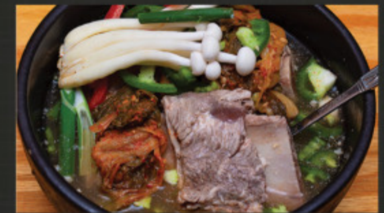
S6 Ugeoji Galbi tang