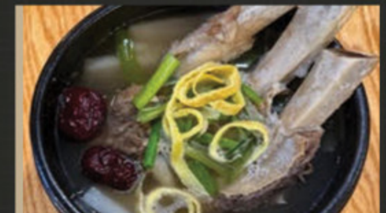
S5 Wang Galbitang