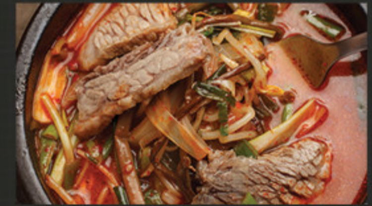
S4 Yuk gae jang

Kimchi stew made with ripened kimchi, pork and tofu